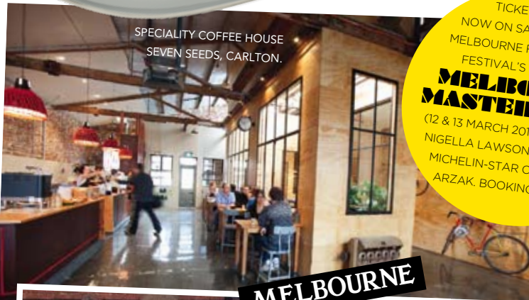
SPECIALITY COFFEE HOUSE SEVEN SEEDS, CARLTON.

LEADING AUSTRALIAN CHEFS TETSUYA WAKUDA AND DAVID THOMPSON HAVE EACH OPENED SOUTH-EAST ASIAN OUTPOSTS. WAKUDA'S WAKU GHIN RESTAURANT IN SINGAPORE, WHICH SERVES ONLY 25 GUESTS A SETTING, WILL BE HOME TO THE RENOWNED CHEF FOR SIX MONTHS A YEAR. THOMPSON'S NAHM BANGKOK SITS WITHIN THE METROPOLITAN HOTEL, WITH A THAI MENU PITCHED AT LOCAL AND INTERNATIONAL DINERS.