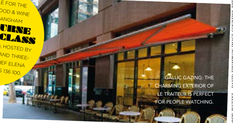
GALLIC GAZING: THE CHARMING EXTERIOR OF LE TRAITEUR IS PERFECT FOR PEOPLE WATCHING.

TICKETS ARE NOW ON SALE FOR THE MELBOURNE FOOD & WINE FESTIVAL'S LANGHAM MELBOURNE MASTERCLASS (12 & 13 MARCH 2011), HOSTED BY NIGELLA LAWSON AND THREE-MICHELIN-STAR CHEF ELENA ARZAK. BOOKINGS 136 100.